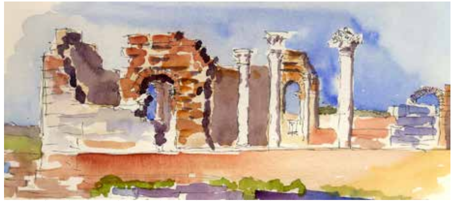
Meknès from the terrace of the Hotel Transatlantique (left) and Volubilis (above and below)

Chefchaouen and Tétouan, which we will visit resemble those parts of southern Spain from which they came. Our four hour drive from Fès will bring us to Chefchaouen (Chaouen for the Moroccans), the “blue city”. It is so named after its blue tinted stucco