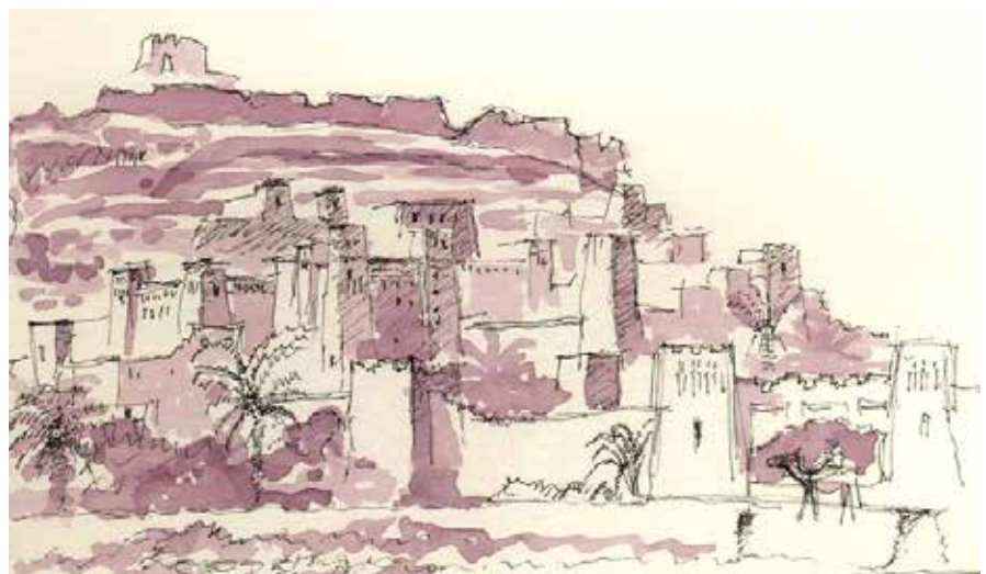
The Kasbah of Ait Benhaddou (above) and that of Telouet (below)

At the ruins of the Badi'a Palace, we will find the 800-year-old wooden minbar (pulpit) from the Koutoubia mosque restored by New York's Metropolitan Museum of Art. The New York Times writes that the minbar "originally consisted of more than a million differently carved pieces of bone and colored woods, some pieces the size of sesame seeds."