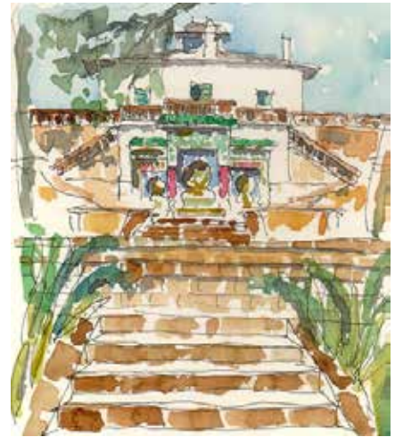
View into a courtyard in Meknès (left), agrand villa in Tanger, and Sunset over Meknès (below)

Today, Thanksgiving in the US, we will journey south of Tanger to the Atlantic coast, where we will immerse ourselves