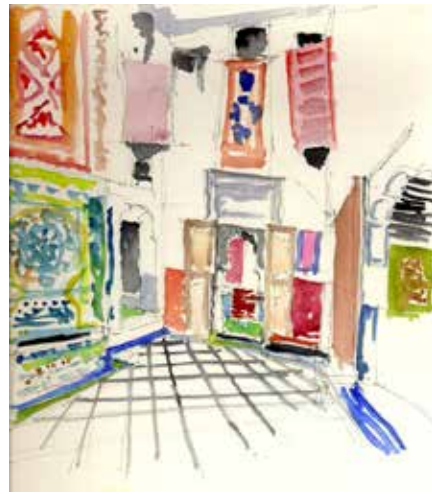
The old Riads of Fès are often packed with caprets for sale. The view of Fès as we approach it (below).