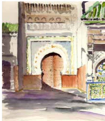
Fès: Medersa Bou Anani (left and right), Najarine (below)