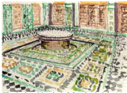
The Souk in Marrakech (left and right below) is a warren of passageways lit from above. Views can be glimpsed through doorways of tile paved courtyards (above).

flair of Paris, the ethnic diversity of New York, the commercial heartbeat of Hong Kong, and a history to rival any city of Europe, Marrakech is above all a city of heart and soul — a city of sunlight on rough pink walls, of fragrant, richly-hued spices, and of rose petals floating in slowly trickling fountains.