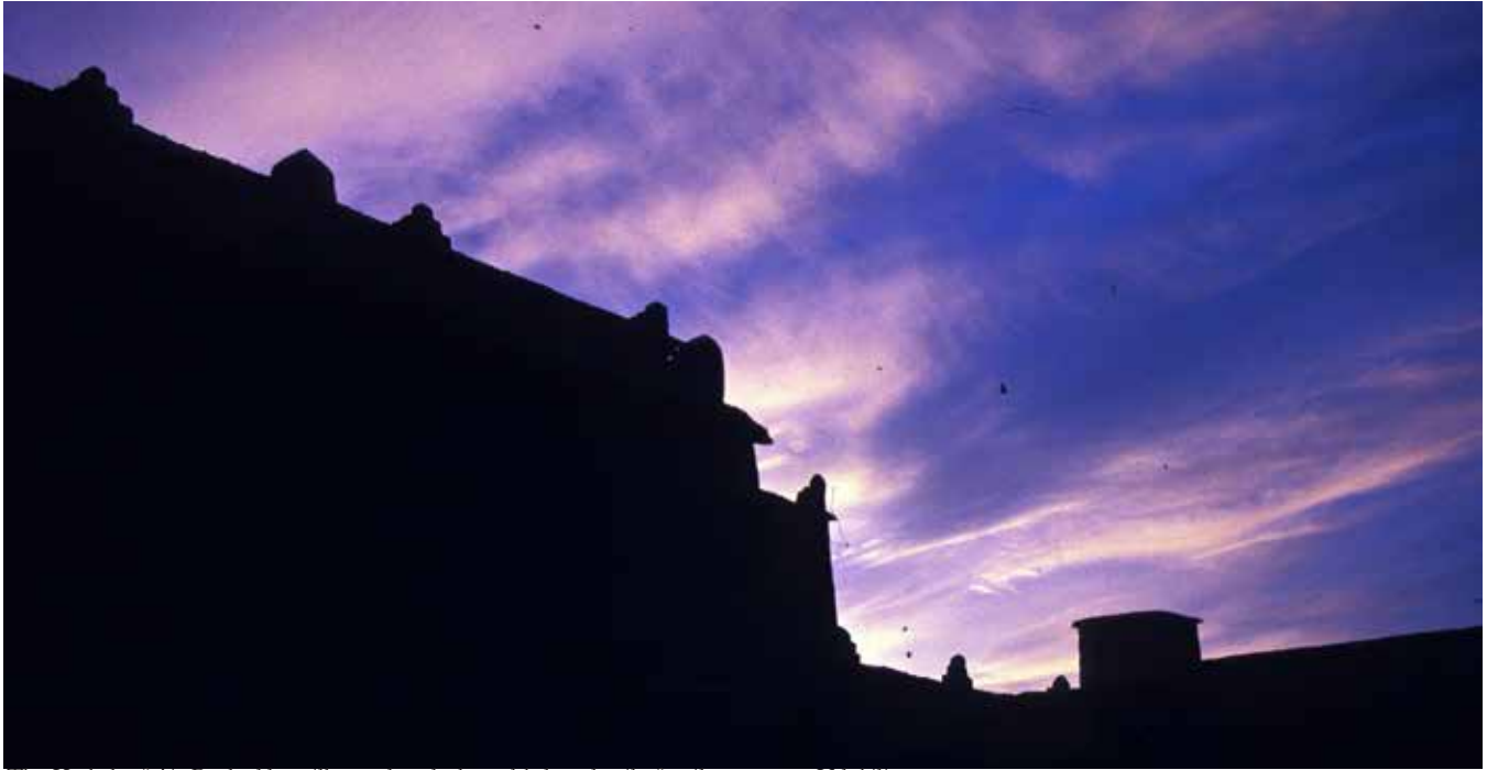
The Kasbah of Ait Benhaddou silhouetted at dusk, and below, detail of a tile pattern at Volubilis.

Experience the exotic and little-known Kingdom of Morocco. Populated by the fierce and indigenous Berbers and conquered by the Arabs 1300 years ago, Morocco is the bridge between Europe and Africa, a country where Jews and Muslims have flourished side by side for over 1,000 years. Morocco offers you a glimpse at the Sahara desert, its lush oases and earthen architecture. It offers the magnificent Atlas Mountains and the sophisticated Imperial Cities of Marrakech, Meknès and especially Fès—often called the world’s best example of a living medieval city.