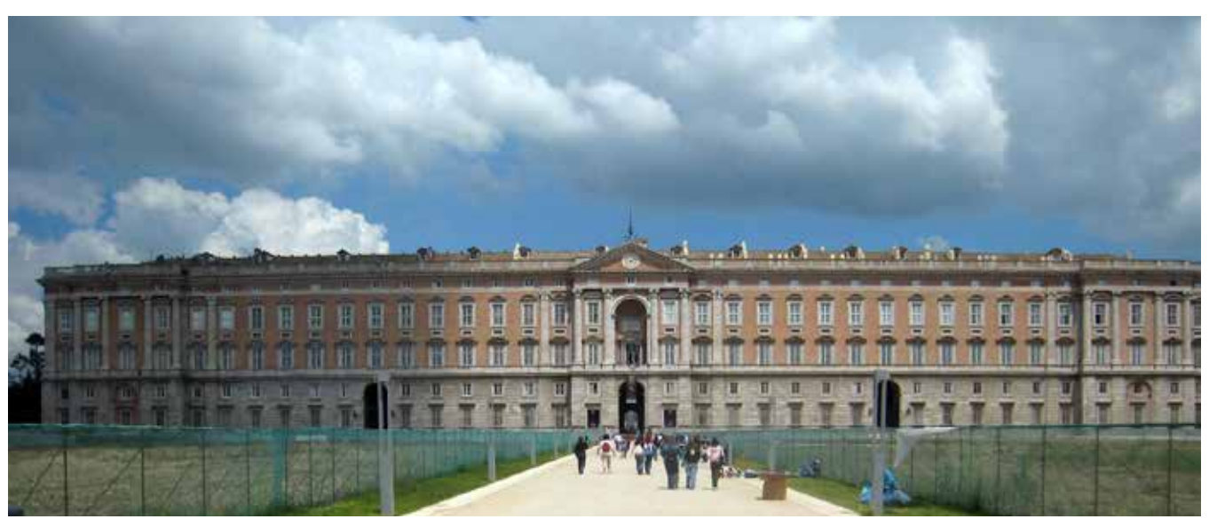
The Regia at Caserta