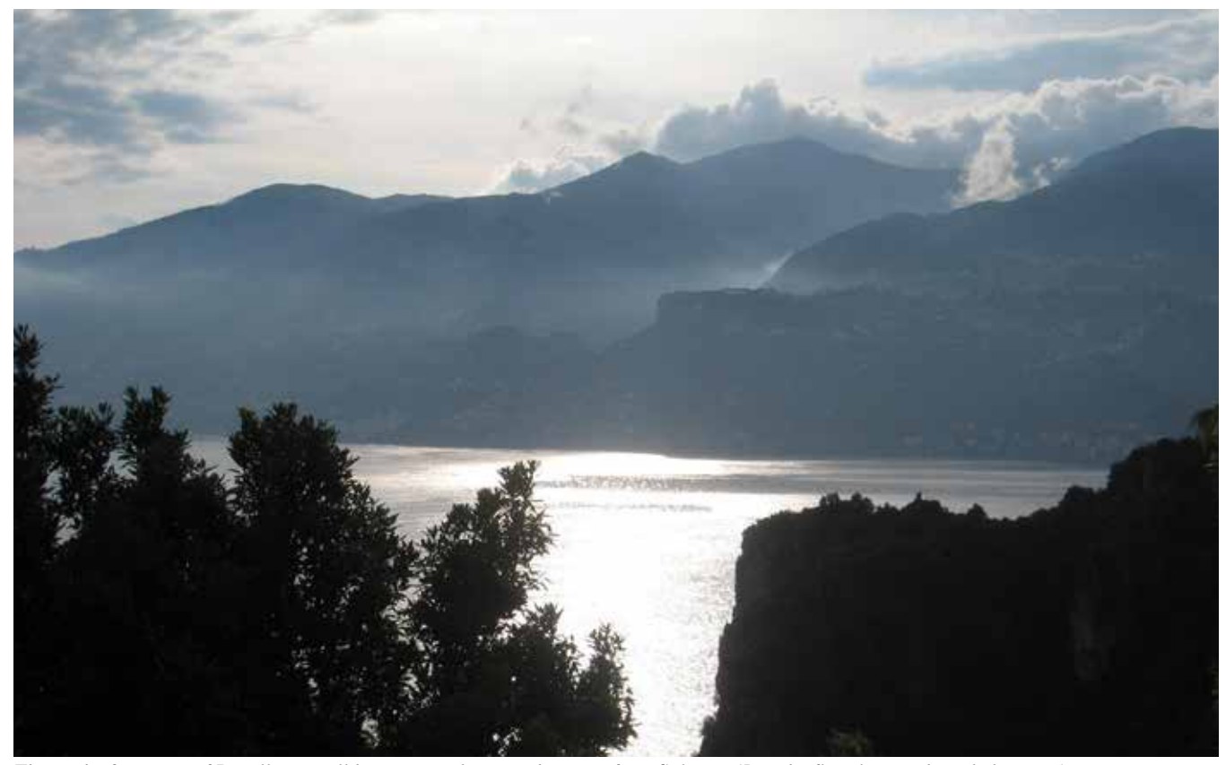
This is the first view of Ravello we will have as we drive up the coast from Salerno. (It is the flat plateau shrouded in mist)

As in our other urban experiences, a reasonable degree of mobility, fitness and stamina will be expected. Our daily walks will be through streets too narrow for large vehicles to pass, and participants should be comfortable both being on their feet for several hours at a time and with walking at a brisk pace (all the better to work off those meals!). Naples is not flat, nor are the archaelogical sites we will visit, so climbing up and down and scrambling over uneven terrain should be second nature.