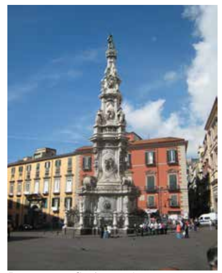
Baroque Guglia (monument in commemoration of survival of the plague) in Piazza Gesú Nuovo.

There will be a walking tour of Spacca-Napoli and its churches, including Santa Chiara, San Domenico Maggiore and the Duomo. We will visit some of the remarkable Baroque palaces designed by Vanvitelli and Sanfelice. We will delve into the Renaissance, Baroque and neo-classical urbanism of Naples, studying the grouping of Castel Nuovo, Palazzo Reale, Piazza del Plebiscito (where a replica of the Pantheon is framed by a version of Bernini's St. Peters Colonnade), Teatro San Carlo and its adjacent Galleria Umberto I. One day we will have lunch or a snack in