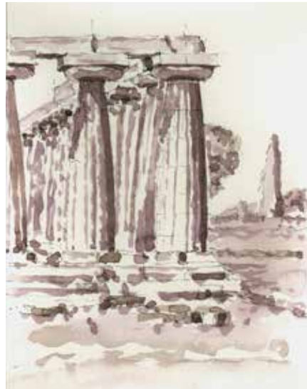
Temple of Hera at Paestum