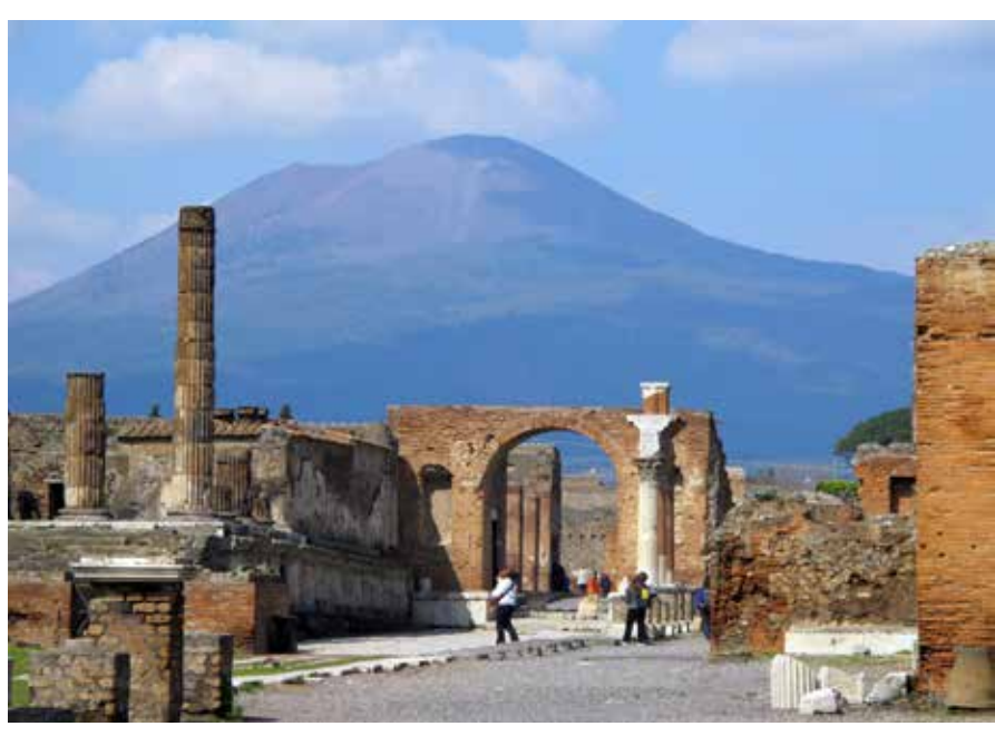
Pompeii with Mt. Vesuvius in background.

After a breathtaking drive along the Amalfi coast from Salerno to Amalfi, we will ascend to Ravello, which