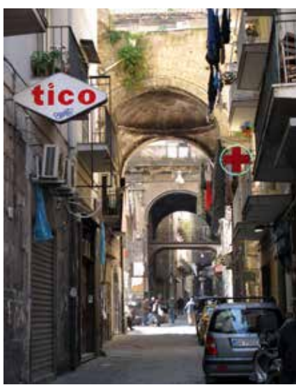
A typical street scene in Spaccanapoli presents a palimpsest of many eras,

We have selected a small hotel in the heart of Naples that is a Liberty style (Italian term for Art Nouveau) villa embedded in a subsequent larger building in a leafy (well not in January) and peaceful courtyard. It is just a block from the famed National Archaelogical Museum in one direction and Spaccanapoli in the other. The penultimate night of the trip we will spend down on the Amalfi coast in Ravello. We will experience the drama of that famous place perched above the spectacular coastline, and on our way there we will go further south to see the three Greek temples at Paestum. On our return we will stop at the baroque palace of the Bourbon kings, Caserta. Ravello enjoys one of the most spectacular settings on earth, perched