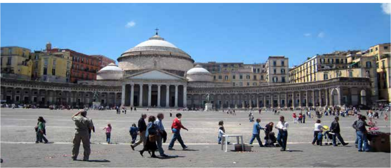
Piazza del Plebiscito

Today we will start at the early stage of the region's recorded history with an excursion along the coast to Pompeii, Herculaneum and the Villa of Oplontis. Here we will see examples of all the major Roman architectural typologies from courtyard houses, to tenements, to theaters, baths and amphitheaters. A number of colorful frescoes are preserved in situ, where at the Villa of Oplontis they are the most vivid and best preserved after a careful restoration.