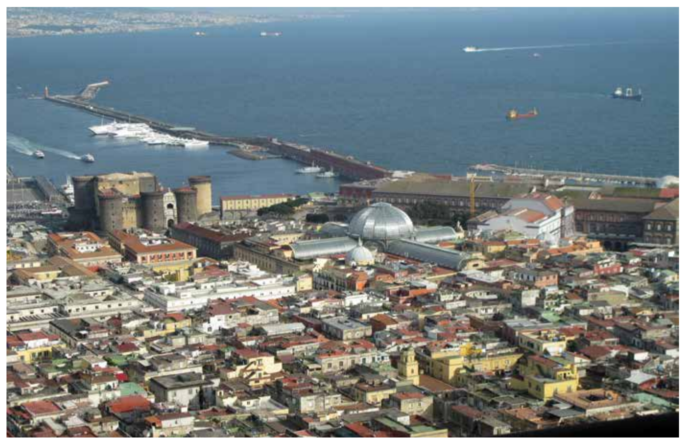
This view from the Certosa features key monuments in the heart of Naples: The Angevin Castel Nuovo with its later renaissance Aragonese Arch, the Galleria Umberto I, The Bourbon Palazzo Reale, and the Teatro San Carlo. Note the prominence of the hue, Naples Yellow

The present offering of this trip has been spurred on by many of those who have recently been with us in Florence and Rome, as well as by our distinguished