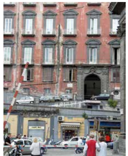
The topography of Naples results in some odd juxtapositions!

But Naples is exaggeratedly and often unfairly reputed to be chaotic, dirty, and dangerous, so, notwithstanding the falseness of this accusation, what better reason than to visit it with a team of experts (many native to the place) who will help us navigate