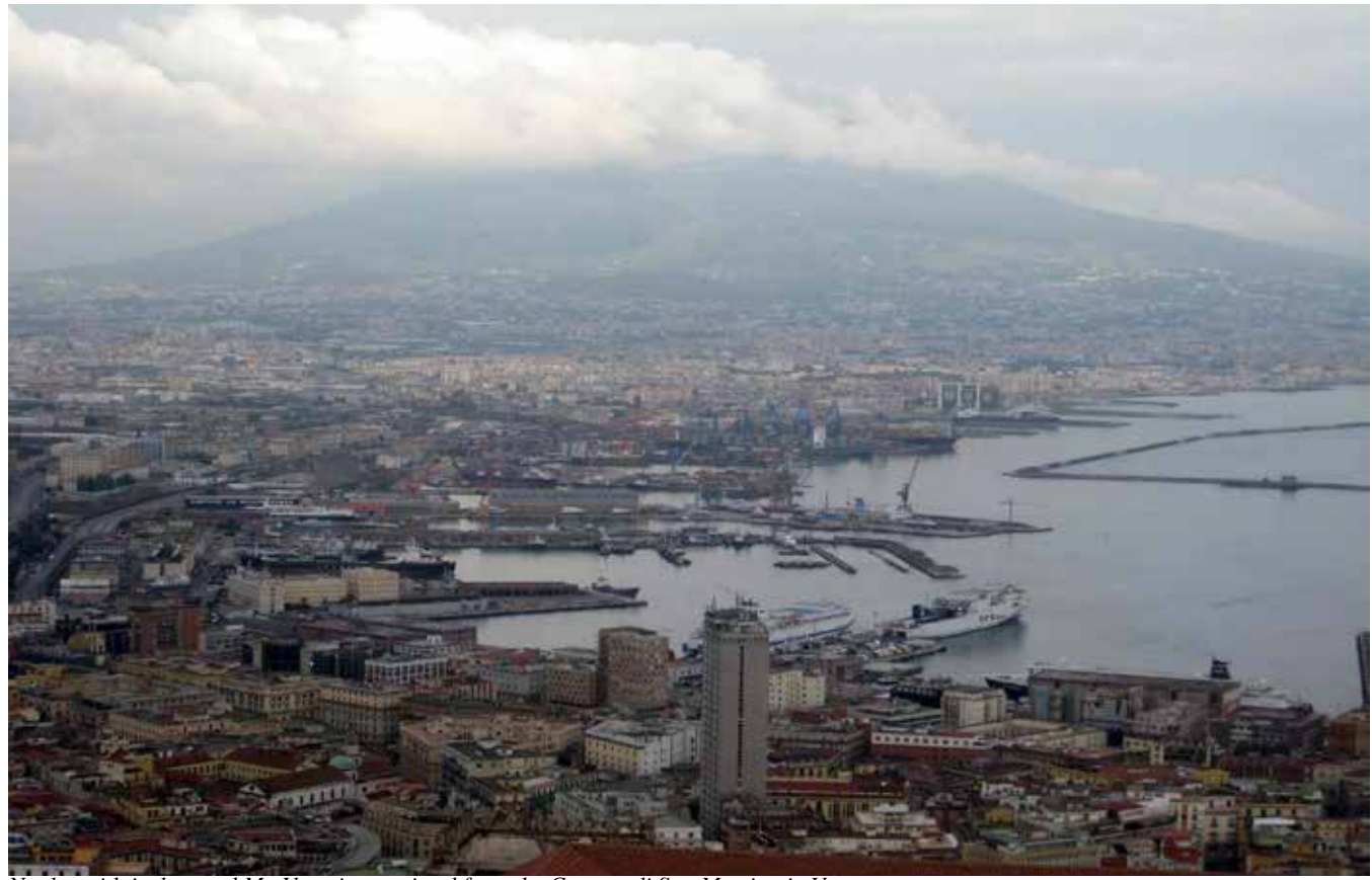
Naples with its bay and Mt. Vesuvius as viewd from the Certosa di San Martino in Vomero

Our proposed eight nights will be spent exploring the city and its environs with a focus on its successive rich layers of history and development. The Greeks as part of their westward colonization settled at Paestum to the south. The very foundations of the city are Roman, and nearby, of course is the great site of Pomeii. Open spaces, buildings and great artworks embodying medieval, renaissance, baroque, neoclassical, and modern and contemporary styles are plentiful and magnificent.