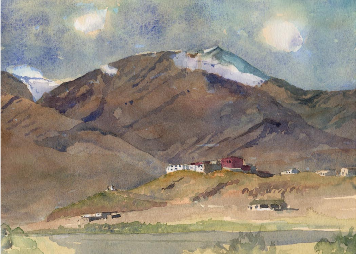
Monastery of Rangdum, watercolor by Stephen Harby (note: prepared from a photographic view. This will be his first visit, as it will presumably be for all!)

September 12 through October 3, 2015 (arrival and departure in Delhi)