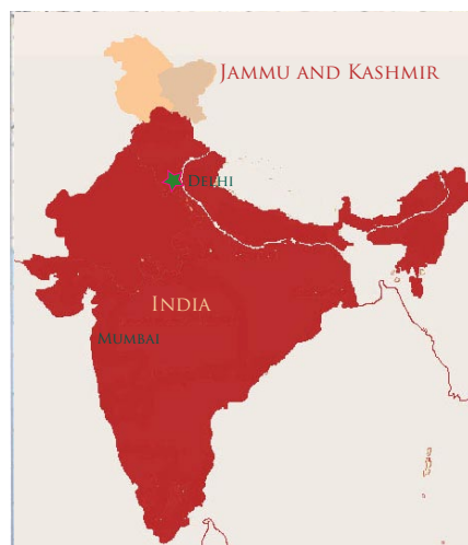
Key map locating the territory to be visited