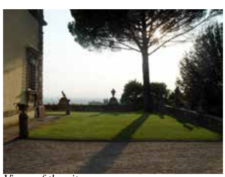
Views of the city

fashion, with a series of in depth lecture visits, conducted by scholars and specialists. We will arrive at an