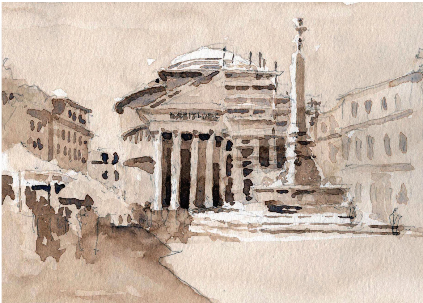
Pantheon Exterior graphite and monochrome watercolor wash on paper, 5x13

Rome is overwhelming—it offers unbelievable artistic riches, but it can be genuinely daunting to visit. It’s been said that it takes a lifetime to experience all that Rome has to offer. If you try to see “everything” during the length of a typical vacation, you’ll only leave frustrated. And getting around the city can be confusing for a first-time visitor. The metro system is only so useful, consisting of just two lines, which don’t serve many of the areas of interest to sightseers. Figuring out the more extensive system of buses, meanwhile, will take longer than your stay. But by starting with the basic structure of the city, and by doing lots of walking, you can accomplish a lot in a few days. You can gain a strong impression of the city’s layout and visit high points of three important periods in Rome’s history: antiquity, the Renaissance and the Baroque.