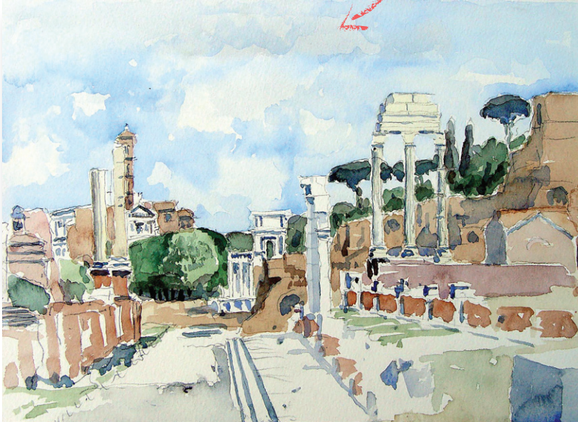
Foro Romano graphite and watercolor on paper, 9x12

You can gain a strong impression of the city's layout and visit the high points of three important periods in Rome's history: antiquity, the Renaissance and the Baroque.