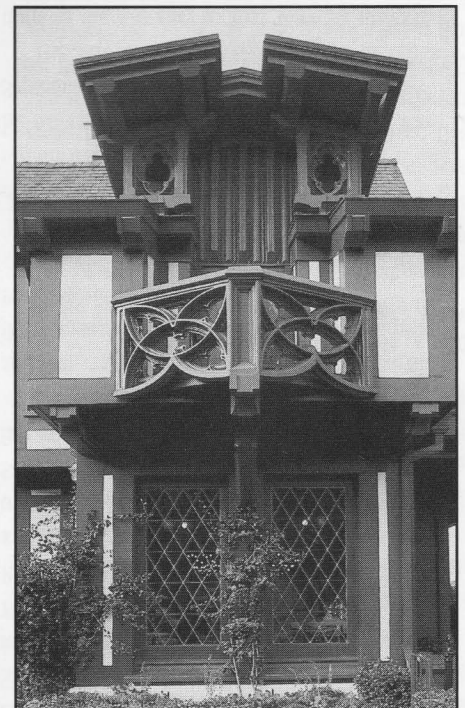
San Francisco, Roos House, 1901, B. Maybeck.

The full tour is eight nights and extends from Monterey to the Sea Ranch, although either the core six night tour or the two night extension may be reserved independently.