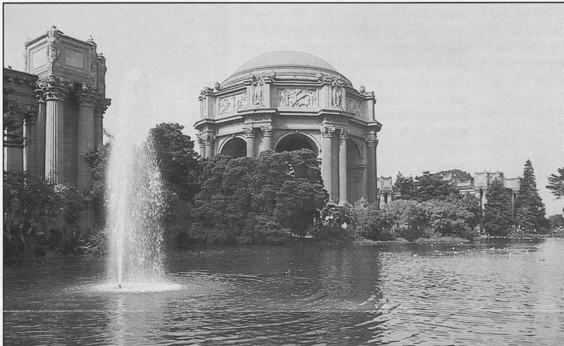
San Francisco, Palace of Fine Arts, 1915, B. Maybeck.