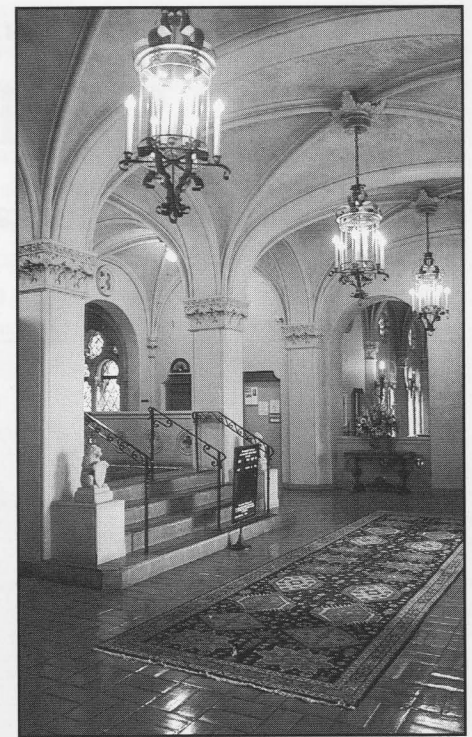
Berkeley City Club, 1929, Julia Morgan.

After lunch we will board our bus for the short trip to the Thorsen House (Greene and Greene, 1909) and on to Maybeck's Christian Science Church (1910). From there we will proceed to the Environmental Design Archive where we will be given a brief overview of the competition entries for the Berkeley campus design as well some of their other holdings. We will end the day watching the setting sun from the Chick House (Maybeck, 1913). Return to our club for a group dinner. (B, L, D)