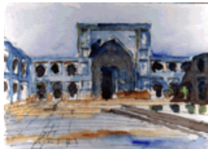
Both images: Isfahan, Shah Mosque