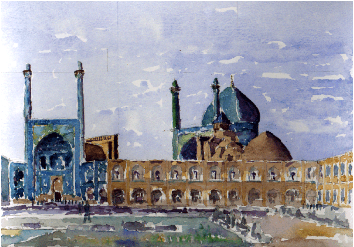
Isfahan: Shah Mosque viewed from the Maidan

M odern Iran is a place that has been much in the news lately. There is far more to the experience of this complex country than the the news of the past 30 years and its most recent turmoil would indicate. Fundamentally, a visit there astonsihes and delights for the warm degree of welcome and hospitality that awaits the visitor from the west, and particularly from the United States. Just as experiencing this country today is enlightening and informative, an immersion in traditional Persian culture of the past offers the key to understanding the winds of cultural change and innovation that have swept through this pivotal bridge between the east and the west.