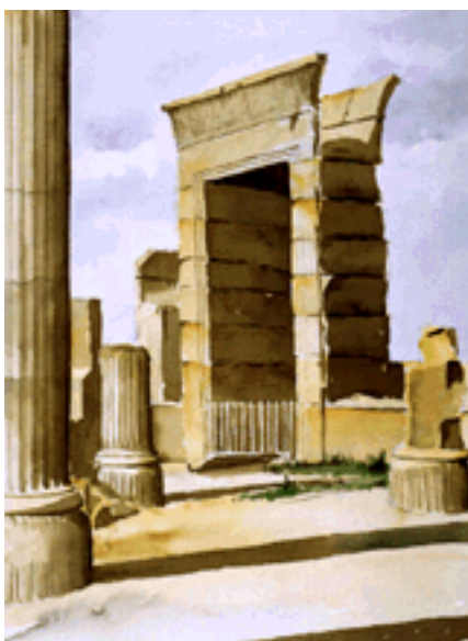
Top: Tomb of Darius, near Persepolis Above: Persepolis

Full day excursion to Persepolis, one of the most important sites of the Ancient World, the ceremonial capital of the Achaemenid kings with remains of the palaces of Darius the Great, Xerxes and Artaxerxes, and its famous bas-reliefs, depicting kings and courtiers and gift-bearing representatives of tributary nations of the Persian Empire; also visit Naghsh-e-Rostam to see Ka'be-Zardosht (fire temple/sanctuary), and Royal Tombs (also Achaemenid); plus seven magnificent Sassanian rock-reliefs (including Shapur the First's famous victory over Roman Emperor Valerian); and Naghsh-e-Rajab, a nearby grotto with several more Sassanian reliefs; return to Shiraz.