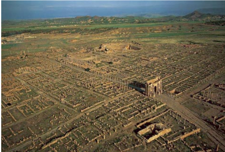
the vast second century Roman site of Timgad will be a highlight

Extension at end for an additional week to see Western Algeria, including Tlemcen and Oran. March 27-31, 2014